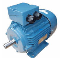
Three Phase Motors all types & Sizes

* the actual power (preferably) or motor current. An electrician or other suitably qualified person can measure this by using a clamp-on meter. In some facilities, you may be able to determine the motor power by running only this motor (possibly after hours), and timing the electricity meter. (To Be Continued in July).