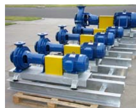
Centrifugal Pump Sets