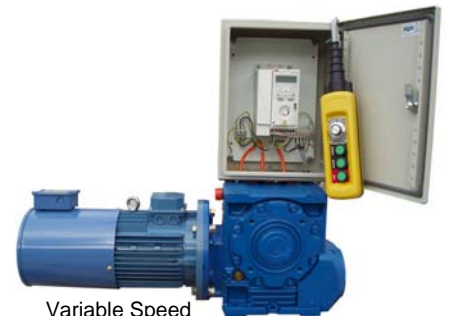
Variable Speed Geared Motor with Remote Control