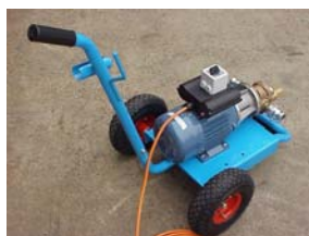
Transformer Oil Transfer Pump