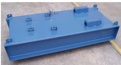
Combined Pump Skid & Diesel Fuel Tank

Designed, Manufactured and Guaranteed to suit our customers specific requirements.